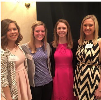
Some of the 2015 Scholarship winners. $10,000 was awarded .